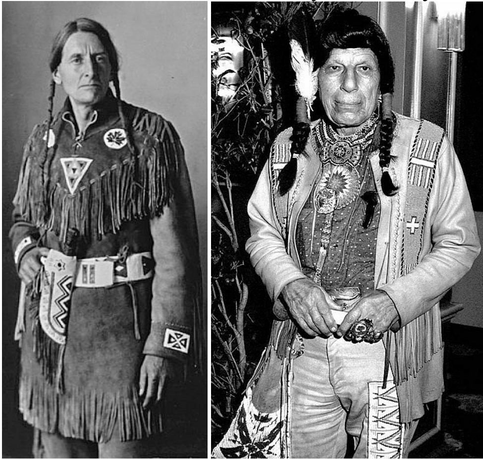
Grey Owl (1888-1938)