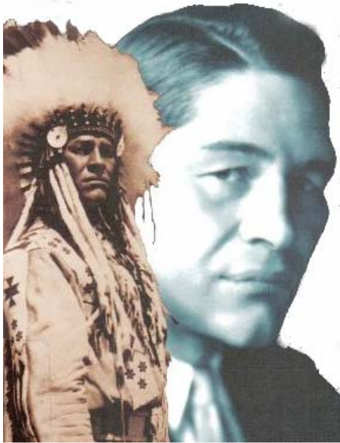
Chief Buffalo Child Long Lance (1890-1932)