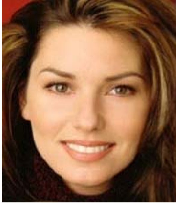
Shania Twain (1965-present)